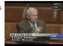
Lyme Disease Floor Debate (9/27/2008)